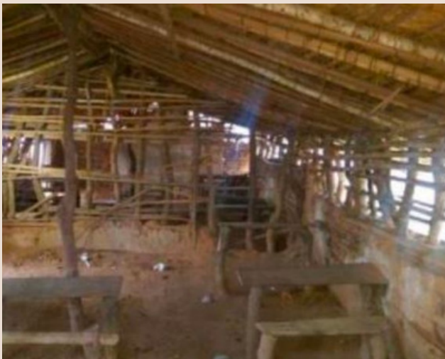
A classroom at Kahumbulu Primary School.

The project will rebuild a safe and decent school, provide uniforms and school supplies, and create an environment conducive to learning. By improving educational infrastructure and resources, FOH aims to encourage school attendance, improve student performance, and relieve families of financial pressures, helping children reach their full potential despite decades of neglect.